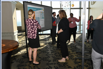
The poster session was a hit!